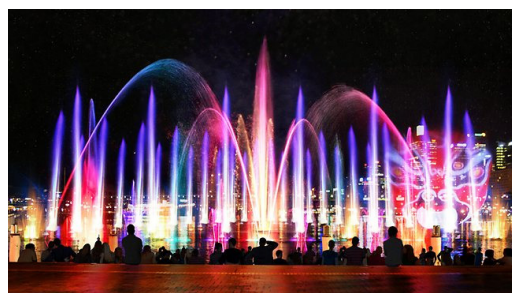
Artists impression of the Water Fountain to be installed at Darling Harbour

What's better yet, Darling Harbour has plenty of shops, bars and restaurants for you to continue your night out along the promenade!