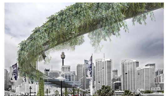
Artist impression of what the hanging gardens could look like