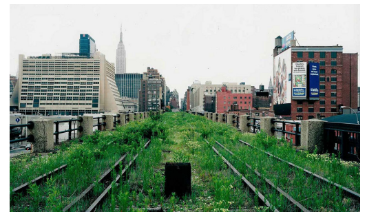
The Highline - Urban Oasis right in the heart of Manhattan Island.

So whip out your iPhones and start snapping!